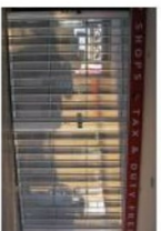
Vision Punched Design