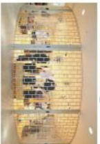
Vision Tube and link Design