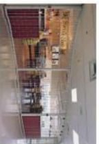
Chain link Design