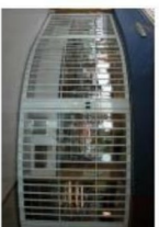
Vision Glass Design